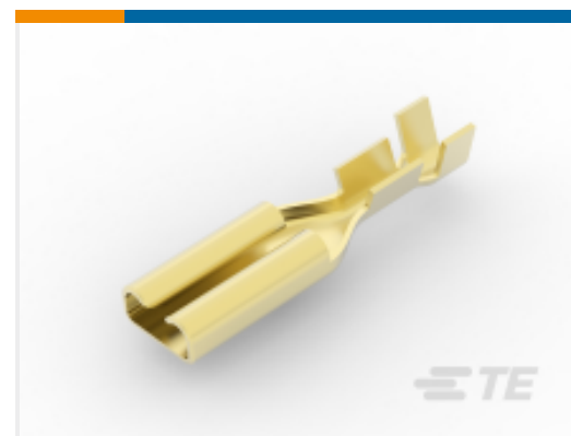
TE Part # 160922-3 FF 110 REC 0.2-0.5MM2 PB