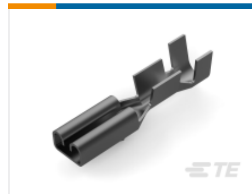
TE Part # 150572-2 MINI FASTON 110 REC 20-16 AWG TPBR