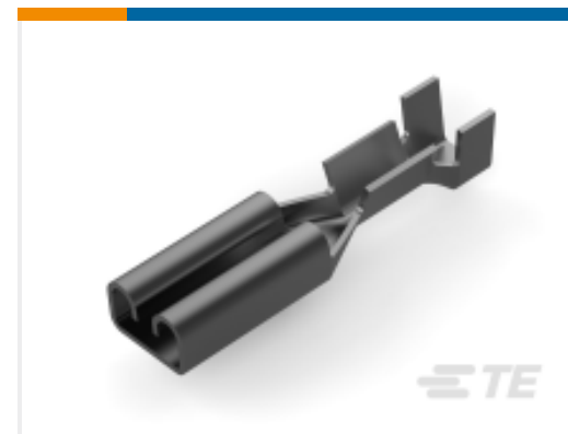
TE Part # 160173-7 FF 110 REC 22-20AWG TPPB