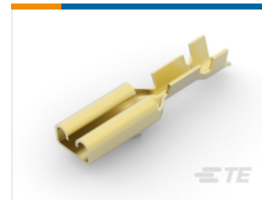
TE Part # 1217281-3 FF 110 REC 24-20AWG BR