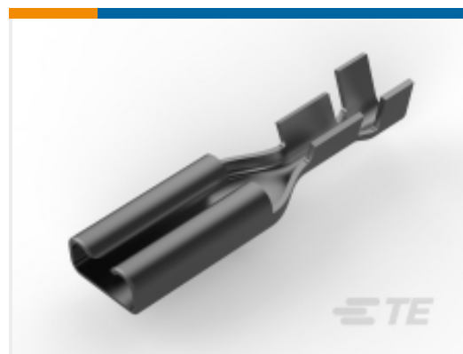
TE Part # 160922-2 FF 110 REC 0.2-0.5MM2 TPBR