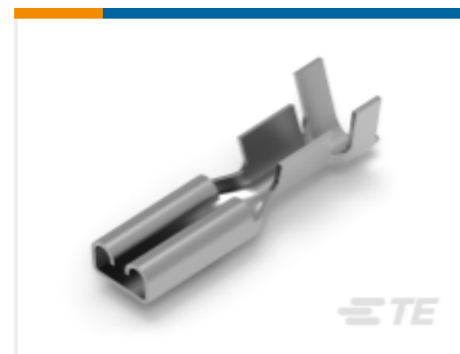
TE Part # 737255-5 FF 110 REC 0.5-1.0MM2 TPBR