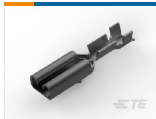
TE Part # 1217281-2 FF 110 REC 24-20AWG TPBR