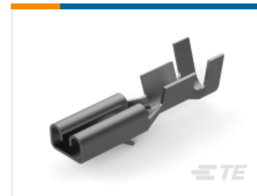
TE Part # 1-160655-1 FF 110 REC 0.5-1.5MM2 BR