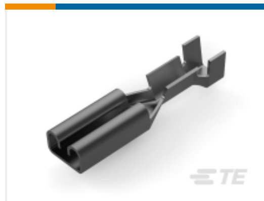
TE Part # 160173-2 FF 110 REC 22-20AWG TPBR