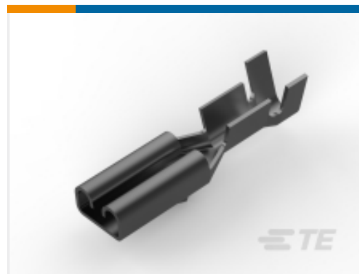
TE Part # 160864-2 FF 110 REC TERMINAL 20-17 AWG PTPB