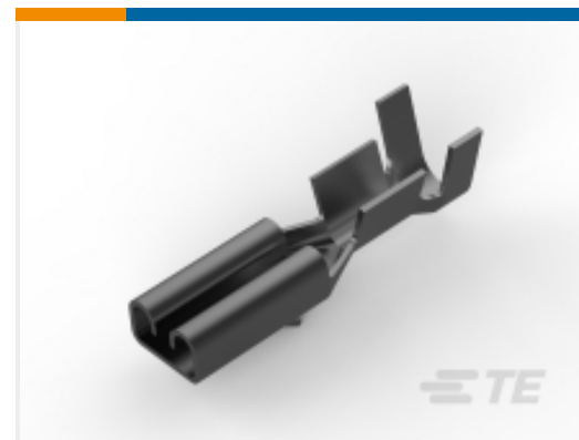
TE Part # 160655-6 FF 110 REC 20-15 AWG TPBR